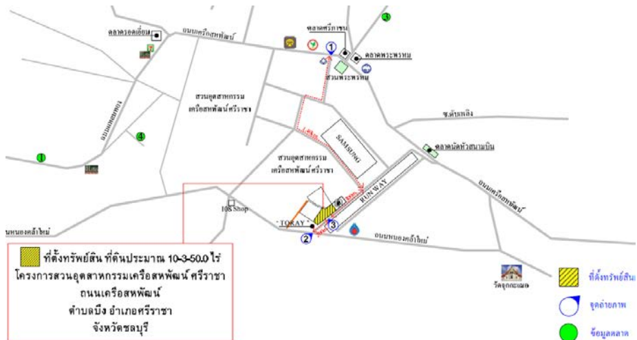
Location of the land that TTM will purchase from SPI.